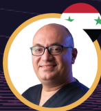
Talal Al-Nahlawi Syria